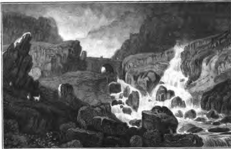
FALL OF THE OGWEN